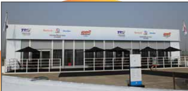
Double-Unit Semi-Custom Chalet, Standard Gable Graphic