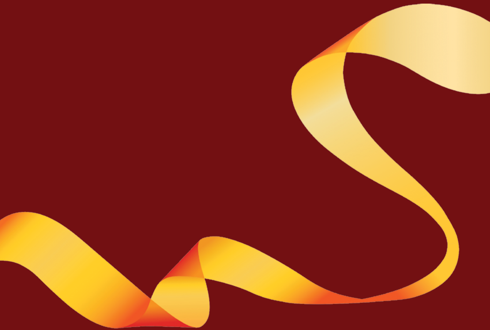
EXHIBIT AT ASIA'S PREMIER BUSINESS AVIATION EVENT

Submit your exhibit application by the November 10, 2016 priority draw deadline.