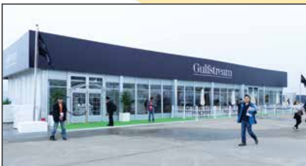
Triple-Unit Semi-Custom Chalet, Standard Gable Graphic