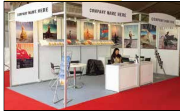
Shell-Scheme Double Unit; Additional Fee for Wall Graphics